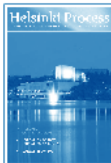
Helsinki Process Magazine 3/2005