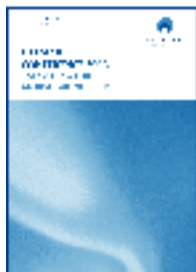
Helsinki Conference Report: Helsinki Conference 2002 – Searching for Global Partnerships , January 2003