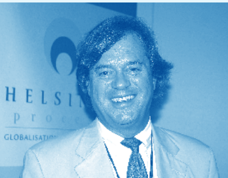
Jean-Francois Rischard from World Bank advocated for innovative methods of global problem solving in the various convenings of the Helsinki Process.

At its base, democracy describes the most reliable procedures for peacefully settling the disputes that arise in any society. Democracy has, however, another powerful effect as is best explained in the insight of Nobel economist Amartya Sen: “Democracies prevent famine, not because they are richer but because they resolve conflicts more readily and distribute the gains more responsively. For every person that dies in civil conflict, more than 60 people die due to the collapse of governance and service delivery in the wake of conflicts.”