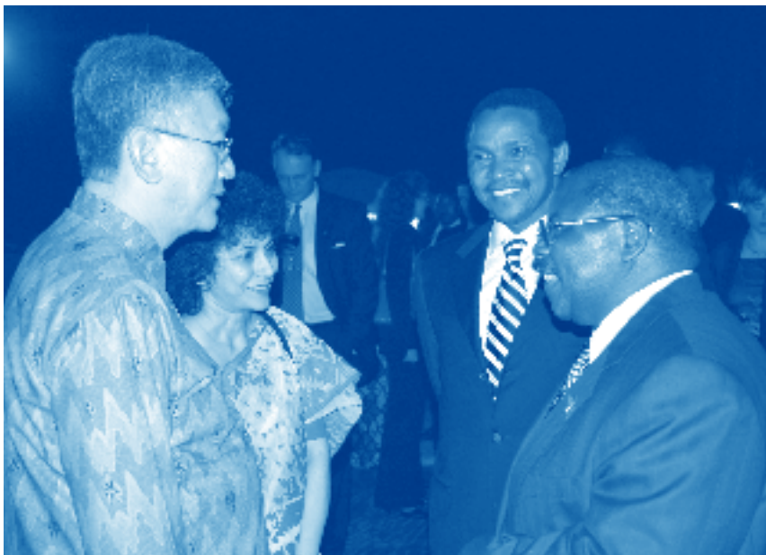
Martin Khor, Irene Khan and Jakaya M. Kikwete meeting with President Benjamin Mkapa.

from the work of the Helsinki Process have helped to broaden the network of the Process. The website of the Helsinki Process ( www.helsinkiiprocess.fi ) has been the focal point of activities and where reports and resource materials of the key events and activities can be found.