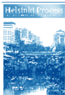
Helsinki Process Magazine 2/2005