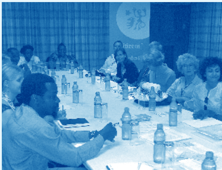
Members of the Helsinki Group engaging with the Citizens' Global Platform.

Sectoral ministers have stove-piped mandates with heads of government being the only national authorities who can mandate cross-sectoral strategies. Industrial countries need to bring trade-finance-environment-energy-foreign affairs-and-development co-operation officials into a policy coherence framework to marshal resources for global challenges. Developing country heads of government must bring health-education-environment-finance-trade-and-development ministries together to forge multisectoral agendas to achieve the MDGs within their own priorities. Environment ministers alone cannot manage global climate change given that industry, energy, finance and foreign ministries must also be involved. Business and civil society leaders have critical roles to play in each policy nexus wherein global issues intersect. This new way of doing business needs po-