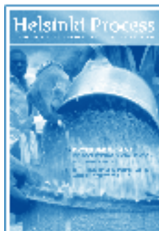
Helsinki Process Magazine 1/2004