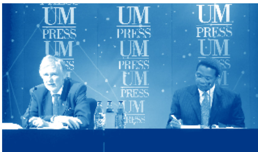
The Co-Chairs of Helsinki Group – Ministers Erkki Tuomioja and Jakaya M. Kikwete.

The key idea behind the process, facilitated by the Finnish and Tanzanian governments, was the notion that various stakeholders—governments, civil society, the business community, international organisations, academia and even the media—can play a major role in accelerating thinking on global problem-solving and on implementing global commitments. In fact, different stakeholders have such diverse resources at their disposal that they could make a difference in ad-