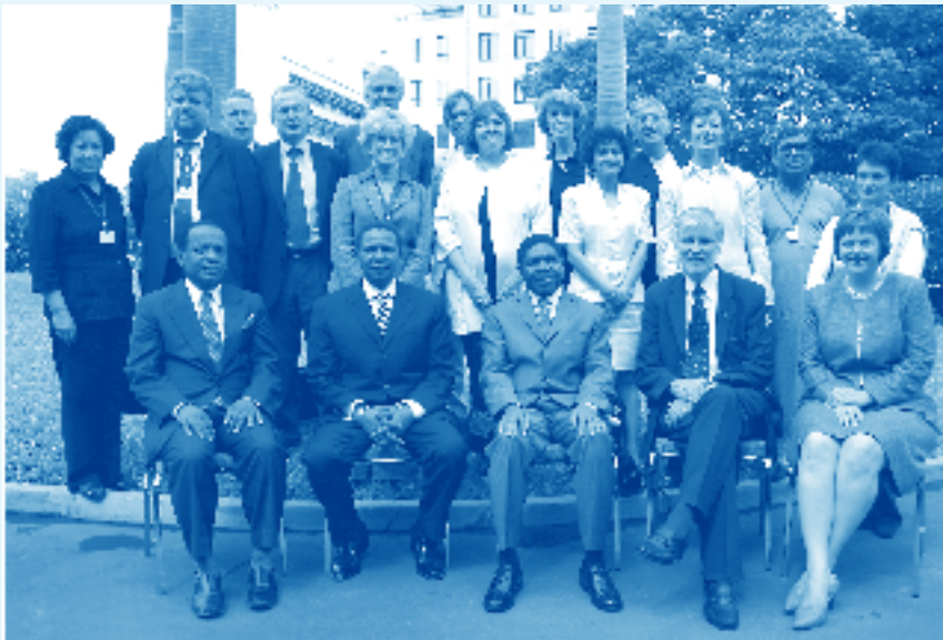
Members of the Helsinki Group during a meeting break in Dar es Salaam, Tanzania in August 2004. The personal contributions of the Members of the Helsinki Group discussing global priorities and future of the Helsinki Process can be found from www.helsinki.fi