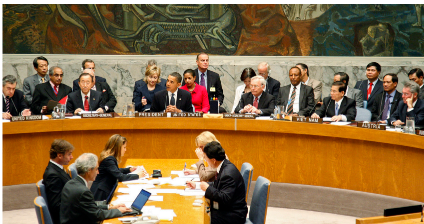
UN Security Council session on 24 September 2009 chaired by US President Barack Obama.

Efforts are underway to make the UN Security Council more representative, legitimate, and efficient. However, the reform project is blocked by disagreements, regional rivalries, and institutional obstacles. A loss of legitimacy is increasingly likely. Small and medium-sized states in particular have an interest in strengthening the UN's comprehensive multilateralism and thus pre-empting tendencies towards unilateralism or ad-hoc coalitions. Unblocking reform demands that all sides display willingness to compromise. It is important that the reform goals not be watered down in the process.