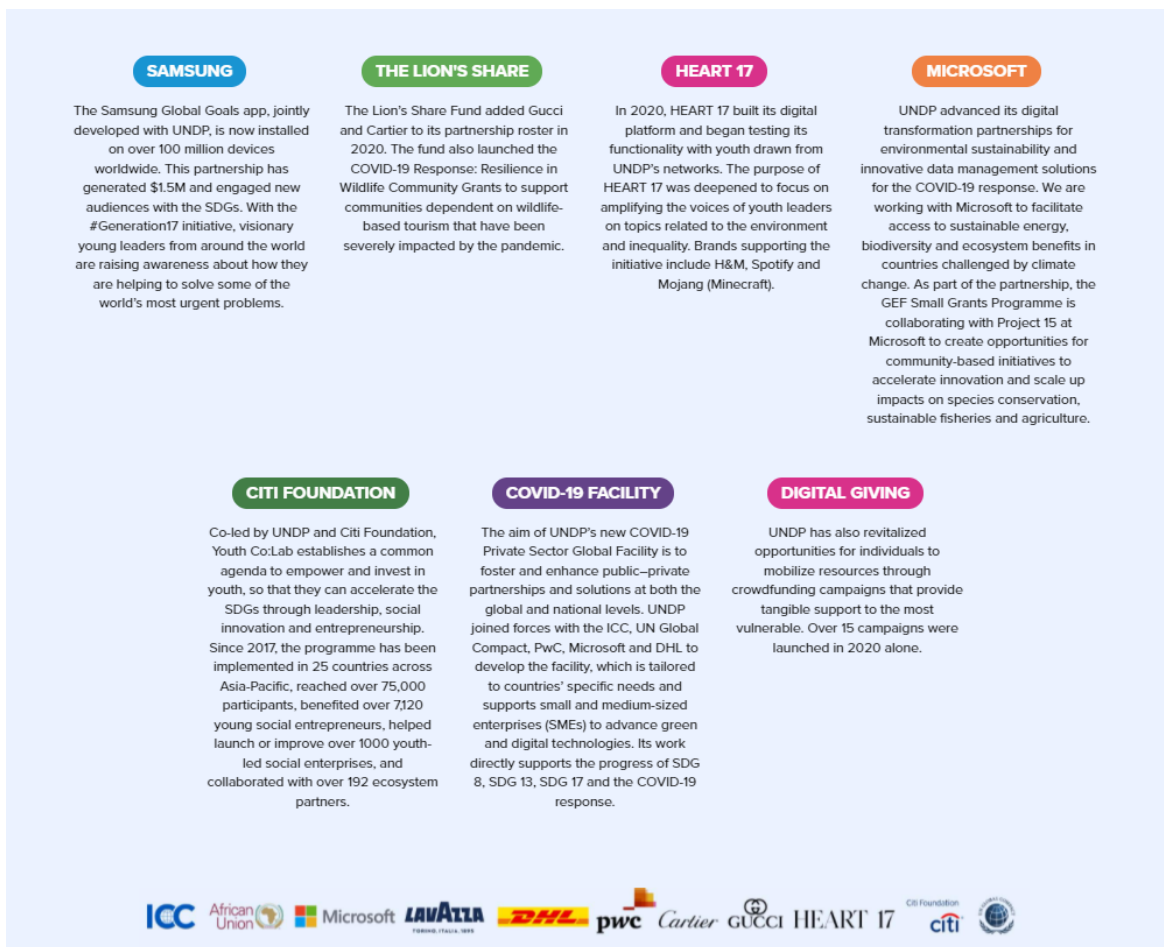
Figure 1.2 UNDP private sector initiatives featured in the 2020 UNDP Annual Report

The Report also highlights UNDP's COVID-19 Private Sector Global Facility, the aim of which is "to foster and enhance public-private partnerships and solutions at both the global and national levels."