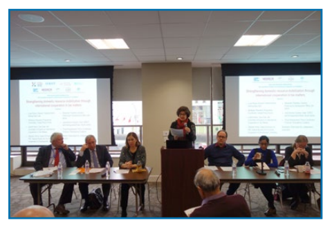
Side event on 8 December in New York