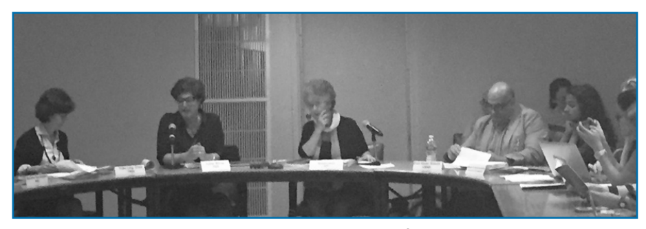
Side event during the High-Level Political Forum for Sustainable Development, 11 July

challenges and obstacles. At the side event key findings and recommendations of the report Spotlight on Sustainable Development were presented. The event was organized in cooperation with the Arab NGO Network for Development (ANND), Development Alternatives with Women for a New Era (DAWN), Social Watch, Third World Network, and Friedrich-Ebert-Stiftung.