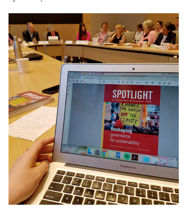
Launch of the 2019 Spotlight on Sustainable Development Report

GPF regularly takes the floor at UN events and other meetings to stress the link between civil society's immediate concerns and UN processes beyond the 2030 Agenda. These include the lead-up to the UN's 75<sup>th</sup> Anniversary, preparations for the 2020 review of the High-Level Political Forum (HLPF), and the repositioning of the UN Development System.